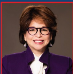
Valerie Jarrett Board Chair, When We All Vote Co-Chair, United State of Women